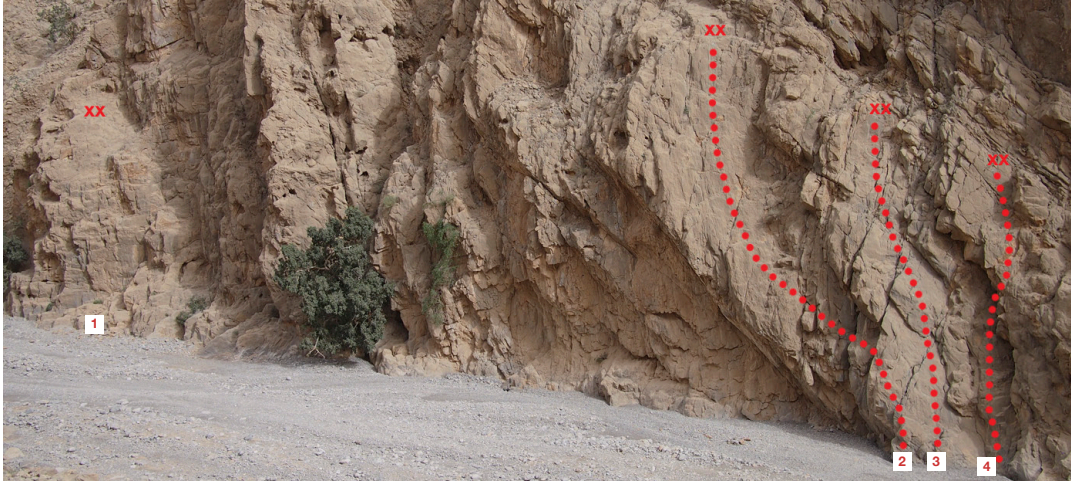
1. [not yet bolted] 15m F4 OK slab route.