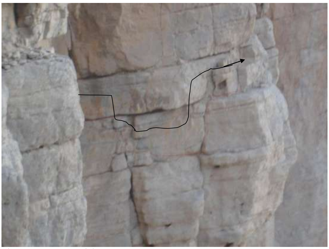
The great escape out right.