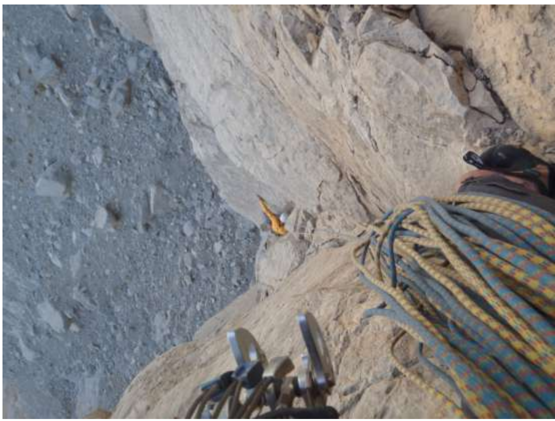
Ralph climbing the arwkward groove. Looking down from the hanging stance of the first belay.