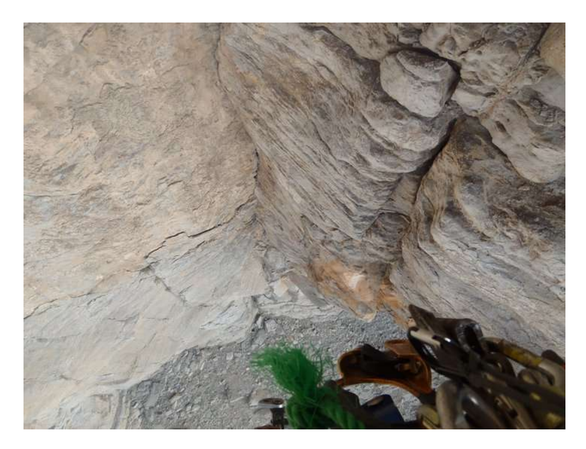
Looking down the second pitch