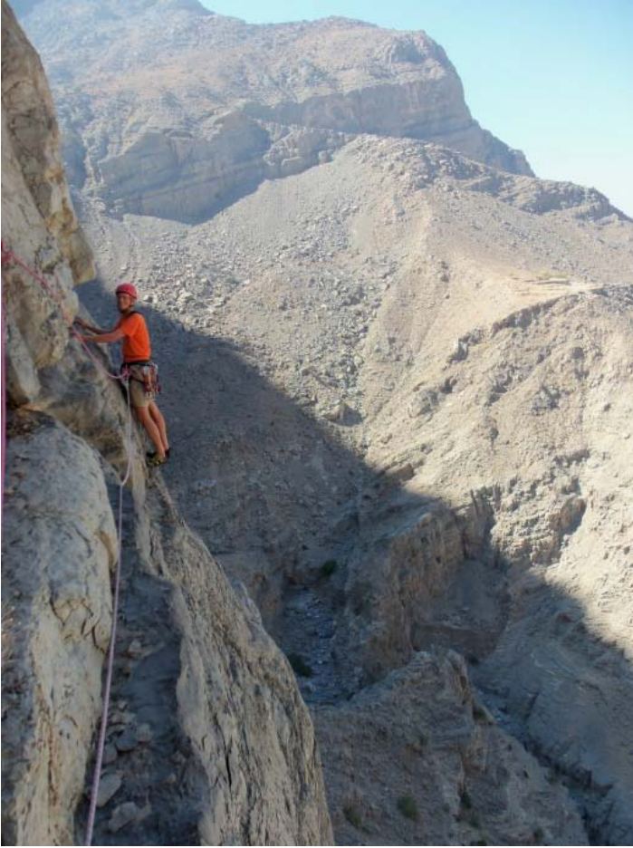
Pete on pitch 6.