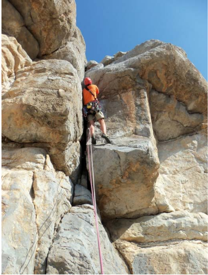
Pete on pitch 8.