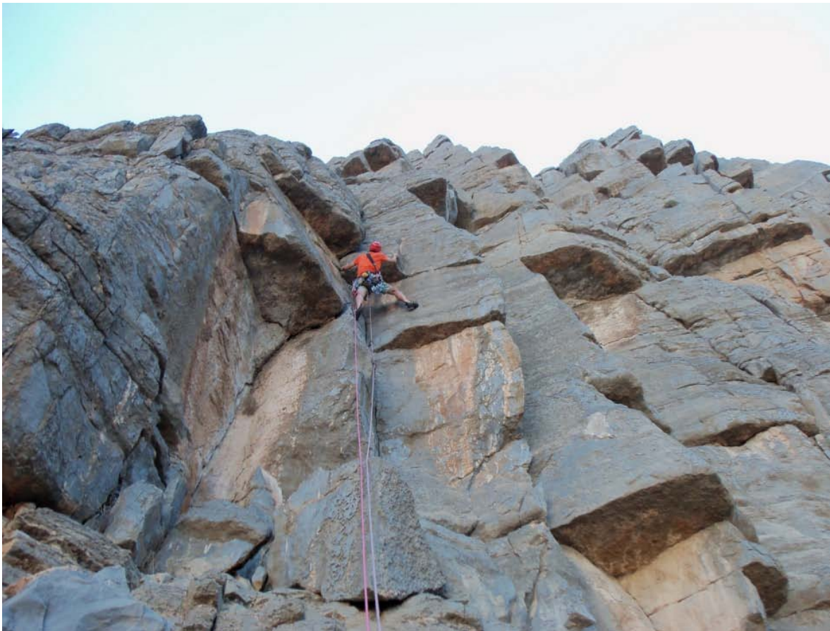
Pete Thompson on pitch 3.